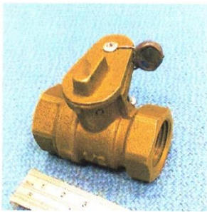
BRASS BALL VALVE WITH LOCKWING, STRAIGHT 1/2"Ø x 2" FTE x FTE