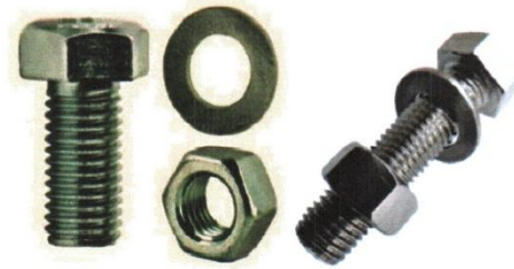
G.I. CAPSCREW 5/8 x 3", full threaded w/ nut and washer, 150 grams