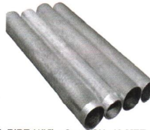
G.I. PIPE 1/2"Ø x 6m, SCH. 40 MTE x MTE, 8 kgs.