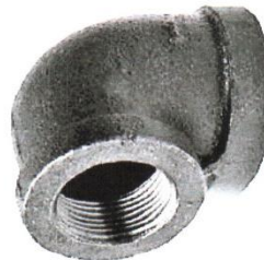
G.I. ELBOW REDUCER 3/4"Ø x 1/2"Ø x 90° FTE x FTE