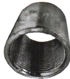
G.I. COUPLING 1/2", SCH. 40, Full threaded, 85 grams