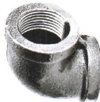
G.I. ELBOW 1/2" x 90°, SCH. 40