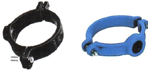
C.I. SADDLE CLAMP 2" x 3/4"Ø, for uPVC