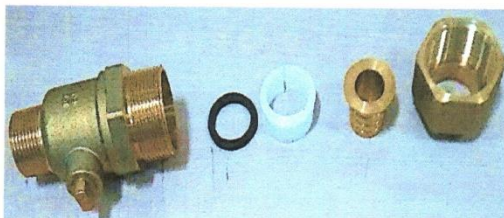
BRASS CORPORATION COCK 3/4" MTE, 750 g. min. weight