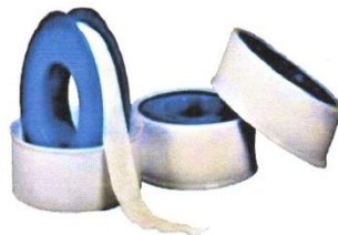
TEFLON TAPE 1/2" x 10mtrs. / PLUMBERS THREADSEAL TAPE