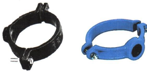
C.I. SADDLE CLAMP 4" x 3/4"Ø, for uPVC