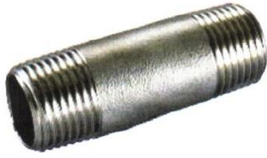
G.I. NIPPLE 1/2 x 2", SCH. 40, 40 grams